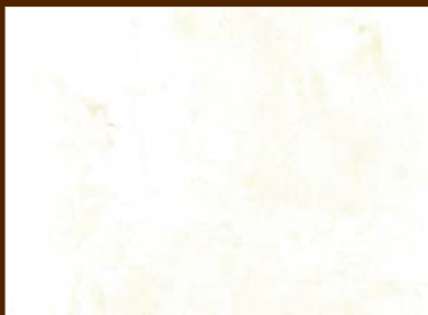
D. Caromal Colours® Smooth Plaster troweled smooth. 2nd layer of Smooth Plaster skip troweled.