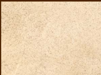
B. Same steps as A, then Caromal Colours® Tea Stain Glaze add 30% water & wash over dried Sandstone.